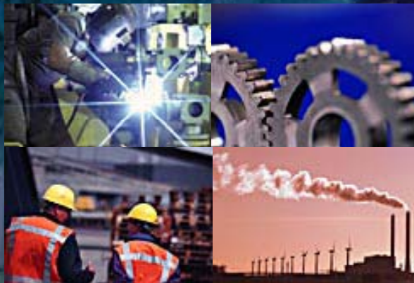
Machine Industrial Era