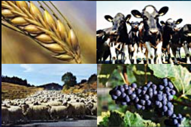
Agriculture Era Land